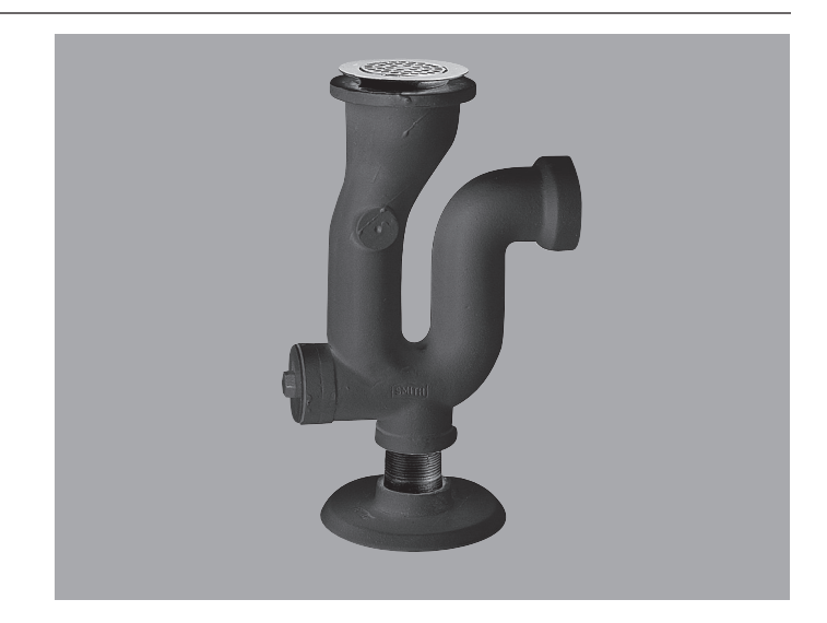
7798.020 / .030 IS FOR ENAMELED IRON SERVICE SINK

Compliance Certifications -Meets or Exceeds the Following Specifications: • ASME A112.19.1 for Cast Iron Plumbing Fixture